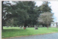
Cemetery Photo Added by: William Tatum

Add a photo for this person Request A Photo